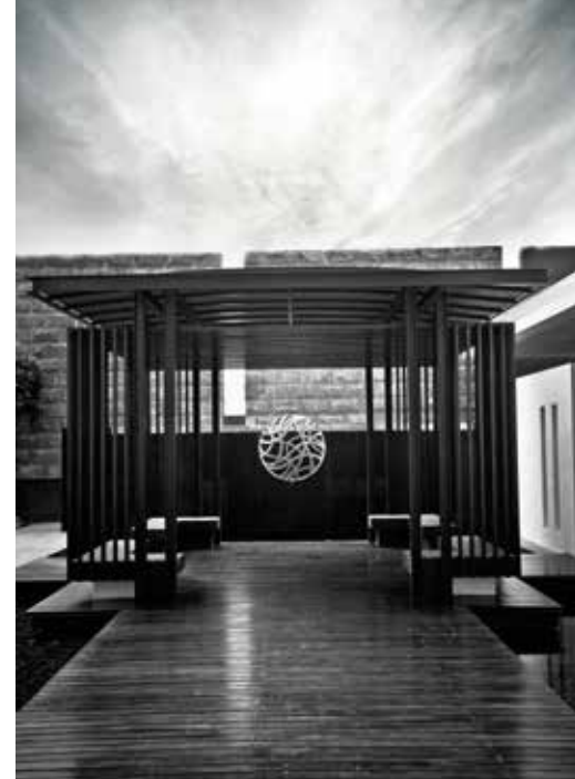
A timber bridge that leads to the rest cube from the entrance lobby

The 'form follows function' structure of the building is a simple rectangular block formed by two rows of outward looking units served by a double-loaded corridor. The units range from 1,000 to 1,500 square feet with the biggest units placed at the corner with a direct sea view. Every unit is afforded with an angular vista towards the sea. This is further exploited with the projection of balconies to each unit.