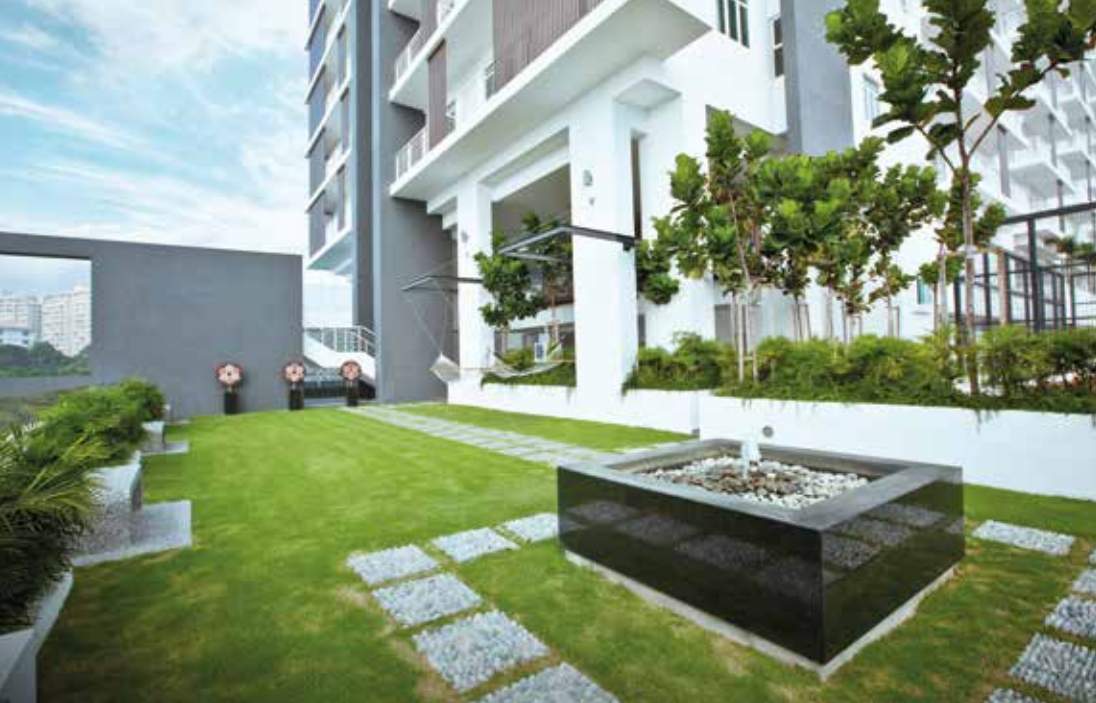
FROM LEFT: The viewing garden at Level 1; The jacuzzi and swimming pool from the upper viewing deck