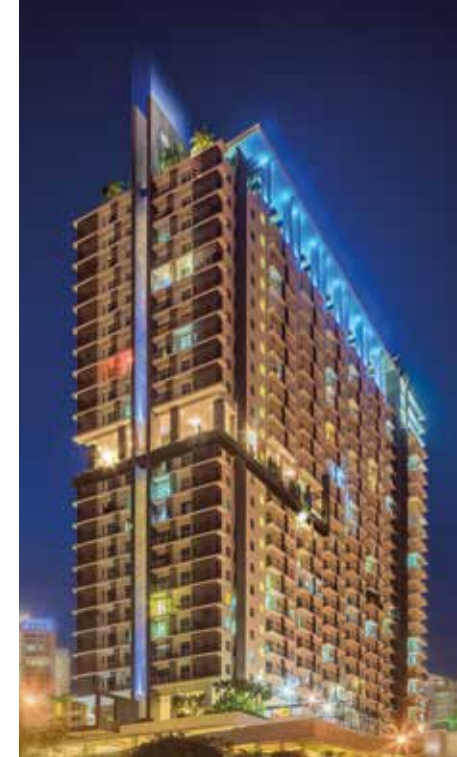
LEFT: Vertical aluminium sunshades create the exterior language of the building; ABOVE: Night view of the condominium

S etia Pearl Island Penang is SP Setia's maiden project in the northern region of Malaysia that began back in 2006. Now almost reaching its maturity stage, this 113 acres housing estate, which had been planned as a self-sustained scheme, bears SP Setia's 'Live, Learn, Work and Play' flagship tagline. The masterplan is predominantly residential with 10 acres of land set aside for a future commercial zone which was initially intended as cookie-cutter rows of shop offices.